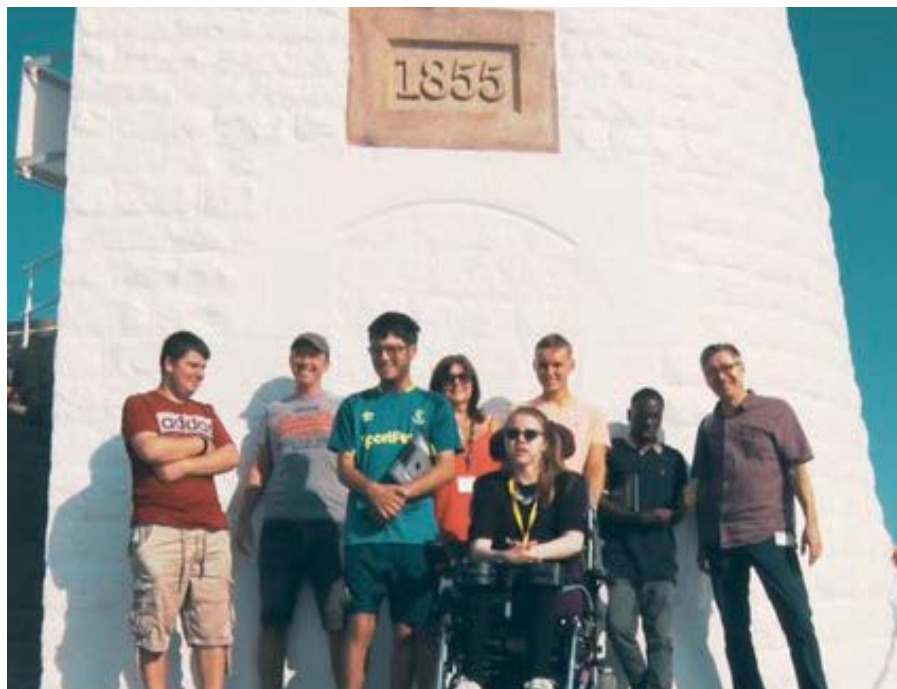
Arthouse Jersey come to where we're from