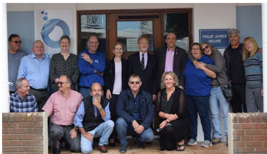
OTC Our People