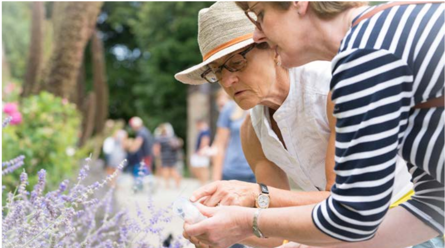
JBC Pollinator Project Volunteers, 2020

In order to recoup some of the costs of the training, some of them will now be charged for, but we endeavour to provide as much training as possible free to charities.