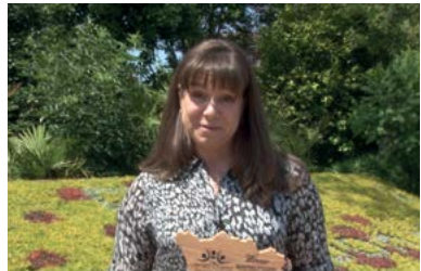
Jersey Child Care Trust

Winner - Outstanding Achievement for a Small Charity