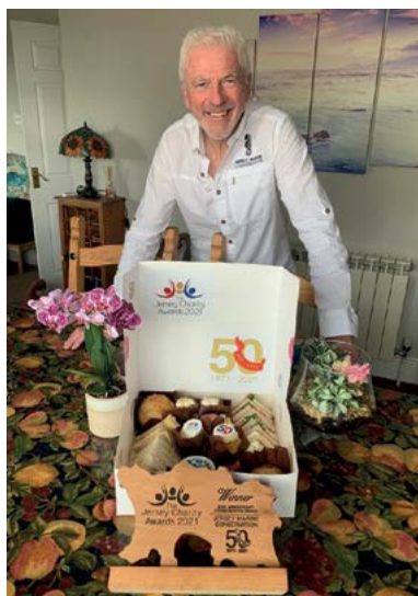
Jersey Marine Conservation, winner, special 50th anniversary commendation award