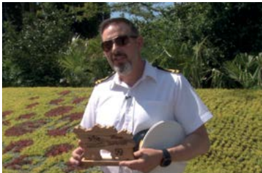
Jersey Sea Cadets

Winner - Outstanding Achievement for a Small Charity