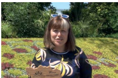
Durrell Winner - Outstanding Achievement for a Large Charity