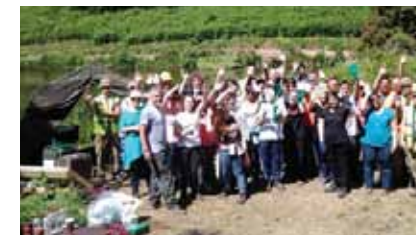
The Pond Project